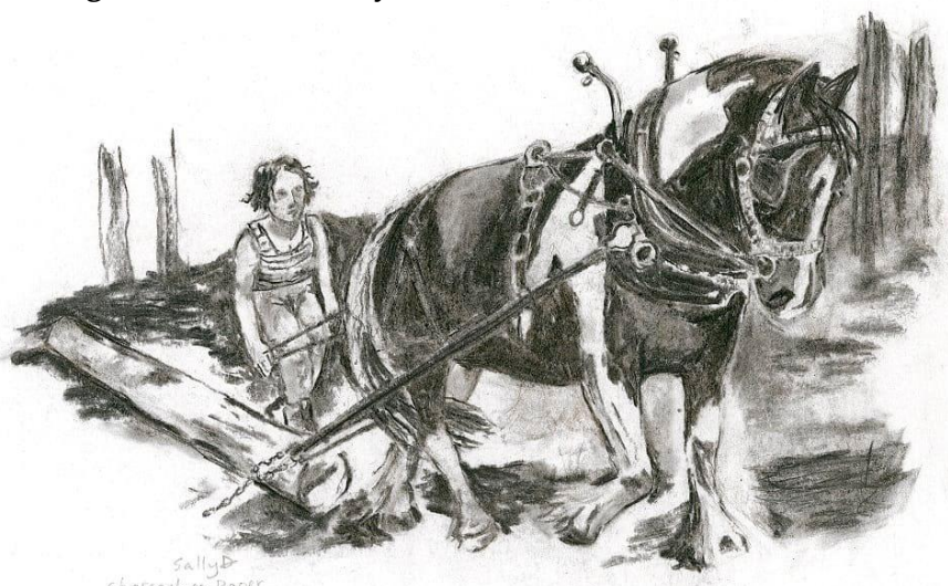
Design 1: Barbara and Tyler

Following the whole process through from felling the trees, extracting them with a horse, making sure all of the wood was used for something useful, and then taking the charcoal to draw these images, says a lot about what Carnog is really all about. It may be old school, but in a preserving traditional skills way. It's about being mindful of what I